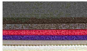
LDPE Foam ✗