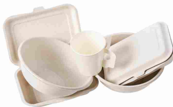
Takeout Containers ✗