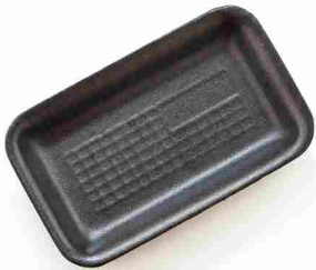
Food Trays ✗