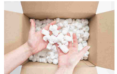
Packaging Peanuts ✗